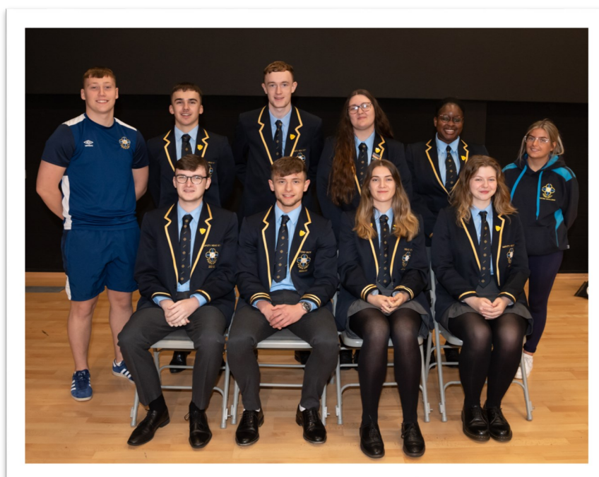
Deputy Heads with Head Boy and Head Girl