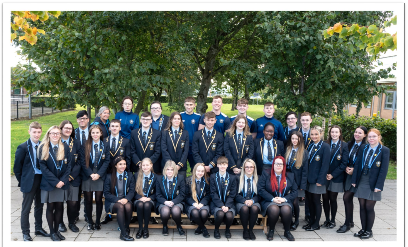
Head Boy, Head Girl, Deputies, Senior Prefects and Prefects